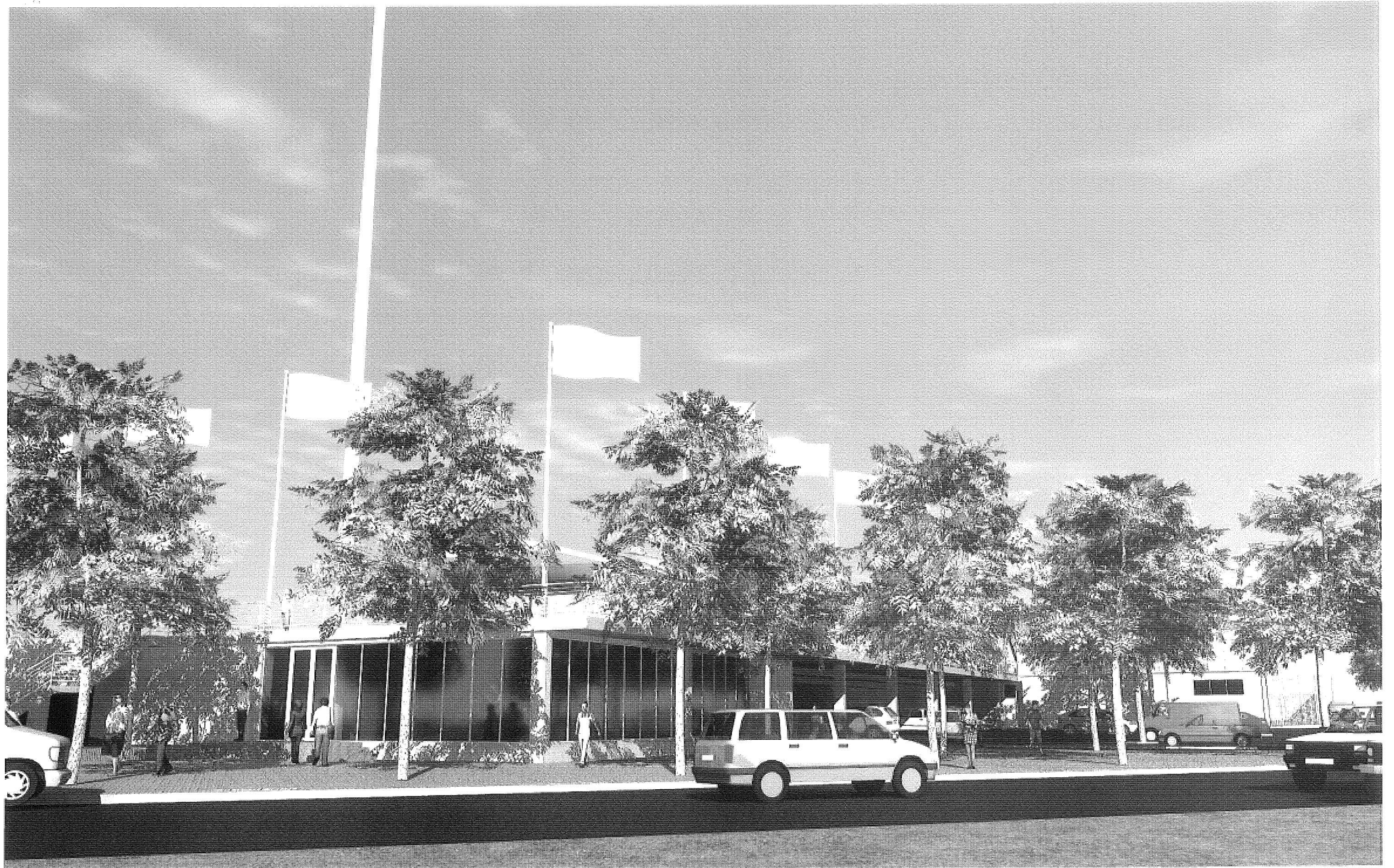
PLAZA NORTH-WESTERN VIEW