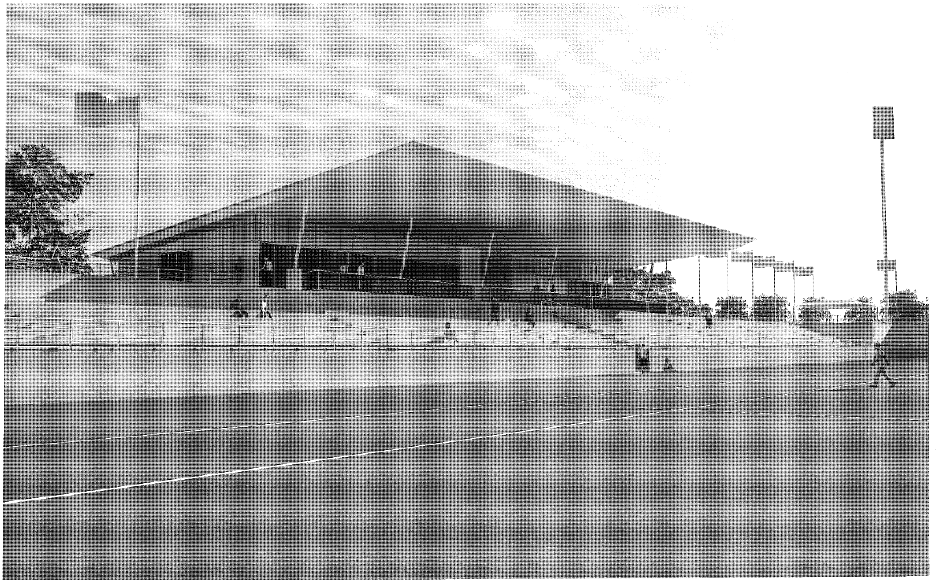
GRANDSTAND EASTERN VIEW